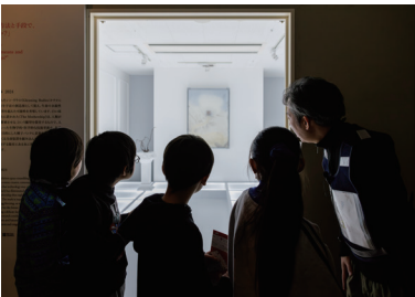
SIAF2024 school invitations to the Future Theater

Details: https://siaf.jp/p20366 *Language: Japanese