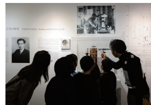
School Invitation Program at the Future Theater

The SIAF School initiative, a participatory program endeavoring to create new learning environments, had already commenced before the festival had even begun. One phase of the program was a series of workshops in which participants created their own snowflakes through programming using applications developed by artists. The artists and workshop leaders visited 12 elementary and junior high schools in the city with a sum of 853 children taking part. Subsequently, the many snowflakes that students had created could be seen raining down on a large-scale screen in the Future Theater, providing an opportunity for children to proactively participate in the creation and exhibition of art via the festival. A special program was also offered to invite those children who participated in the workshop to visit the Future Theater.