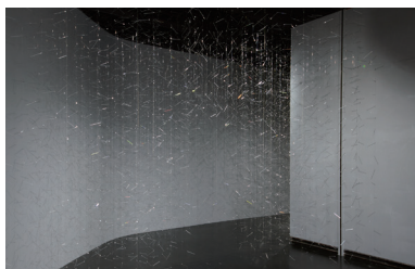
YUKUTAKE Harumi, Frozen Scape