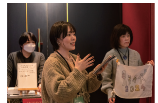
Future Theater Guided Tours by the Hmm... Guides