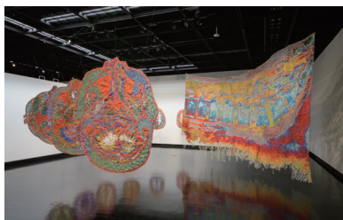
MIYATA Sayaka, MRI SM20110908 and MRI SM20121122

The museum placed a focus on 100 years of art from 1924 to the present day, 2024, showcasing both the facility's permanent collection and new installations by contemporary artists arranged into four sections named after key terms "Expand," "Entrust," "Be simple," and "Connect."