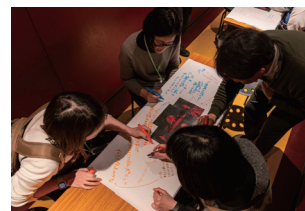
Enjoying the Art Together with Written Communication