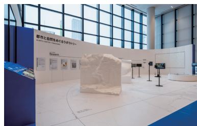
SIAF2024 Visitor Center@SCARTS