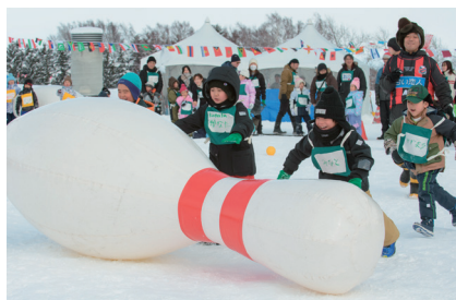
Sapporo Future Undokai