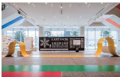
SIAF2024 Visitor Center@SCARTS

Imitating visitor centers found in nature parks, this facility was divided into areas based on their function and hosted co-creation spaces with a wide variety of collaborators from local creators to enterprises and media. The center also hosted numerous events during the festival period, serving as a bustling center of interaction for SIAF2024.