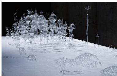
AOKI Mika, installation view at Sapporo International Art Festival 2024