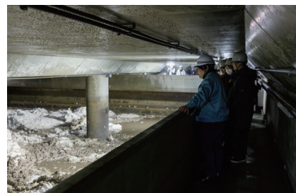
Underground Park: Unknown Sapporo Underground Tour

The last of the Sapporo International Art Festival 2024 (SIAF2024) venues and programs came to a close on March 3 (Sun) after a festival period of 37 days [Jan 20 (Sat) – Feb 25 (Sun), 2024] at the main venues.