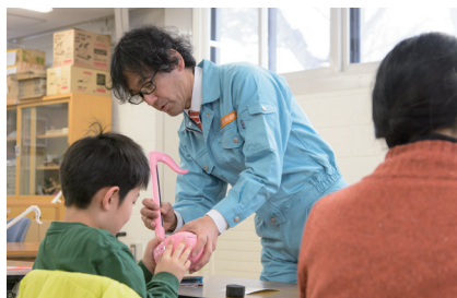
Maywa Denki Workshop: How to Play the Otamatone