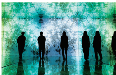
Sony Design in collaboration with HIRAKAWA Norimichi, INTO SIGHT at SIAF2024