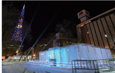
“Snow City in the Future” exhibition view