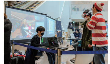
Underground Park: Local Creators Exhibition

“Experimental Zones for the Future” at the Sapporo Snow Festival Odori 2-chome Site, Sapporo Art Museum, Moerenuma Park, and Underground Park stimulated future-oriented thought and innovation. The Underground Park served as a platform for social experiments where projects were assembled to utilize an underground space for the future of Sapporo and saw various experimental initiatives unravel, such as a limited-time-only mobile nursery room and tours of the mysterious underground world. Details regarding the space were announced just before the festival opening.