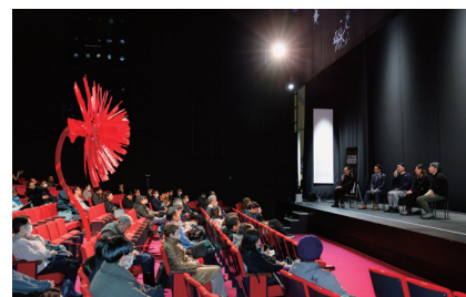
SIAF2024 Post-festival Talk: Mapping the Future