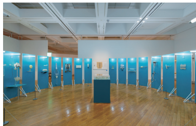
Installation view at “Maywa Denki Nonsense Machine in Sapporo”