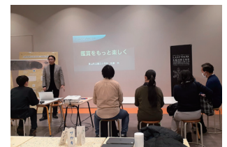
SIAF School Education Café Special Edition -STEAM Study Day in SCARTS presented by schoolteachers

In addition, a total of 198 volunteers, primarily residents of Sapporo, acted as “Hmm... Supporters” and “Hmm... Guides,” enabling deeper connection between SIAF2024 and festival attendees. “Hmm... Guides” navigated visitors around the exhibitions, ultimately leading 71 tours of the Future Theater. A total of 503 participants were provided with guides’ commentary as they made their way around the artwork.