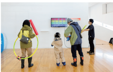
Installation view of “Future Undokai Room”

The park served as the grounds for the Sapporo Future Undokai, consisting of a “hackathon” with the goal of designing new sports and a real-life undokai (Japanese sports day/field day) for all to take part in the games that were created. Five never-before-seen games and a dance were produced, brimming with ideas that uniquely represent winter in Sapporo. Experimental exhibitions by two groups of international artists were also on display.