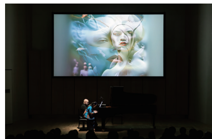
SIAF2024 Ars Electronica Days: Pianographique