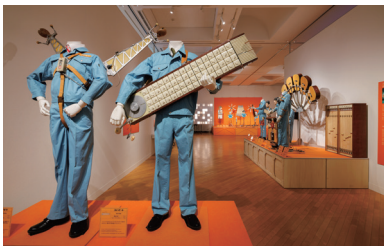
Installation view at “Maywa Denki Nonsense Machine in Sapporo”

Here, visitors were able to come face to face with creativity that gives form to ideas and creates the future through two exhibitions: “Maywa Denki Nonsense Machine in Sapporo,” featuring art unit Maywa Denki, renowned for their unique, interactive products, and “Did You Know that Sapporo is a UNESCO Media Arts City?” which shined a light on creative industries and technology hailing from the city.