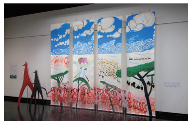
ABE Hiroshi, Light and Wind in Africa (18) : Above the Giraffe's Head, the Day the Cloud babies are Born. and others