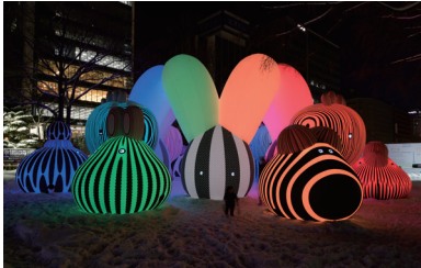
ENESS, Airship Orchestra

Based on the concept of “snow city in the future,” this venue served as a place for social experiments focusing on themes such as future transport and lifestyle. A notably large number of visitors, extending to small children and tourists from both Japan and overseas, observed the possibilities of life in the future in a fantastical setting adorned with light and sound.