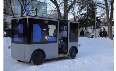
Ryohin Keikaku Co., Ltd.