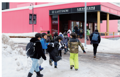
School Invitation Program at the Future Theater