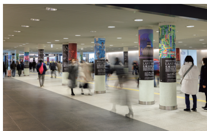
Advertisements in the Sapporo Ekimae-dori Underground Walkway